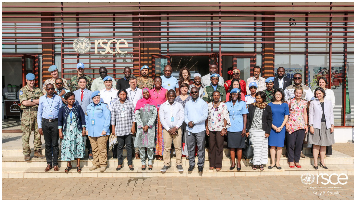
Group photo of women protection advisers from six United Nations peacekeeping missions

THE FOURTH “TRAINING OF TRAINERS” on the integrated training materials on conflict-related sexual violence was conducted during the second week of July 2017 in Entebbe, Uganda. The training aimed to strengthen skills and knowledge to prevent conflict-related sexual violence, deter perpetrators, protect vulnerable sections of society, and support survivors through integrated action. The goal is to prepare their mission components to effectively implement the conflict-related sexual violence mandate.