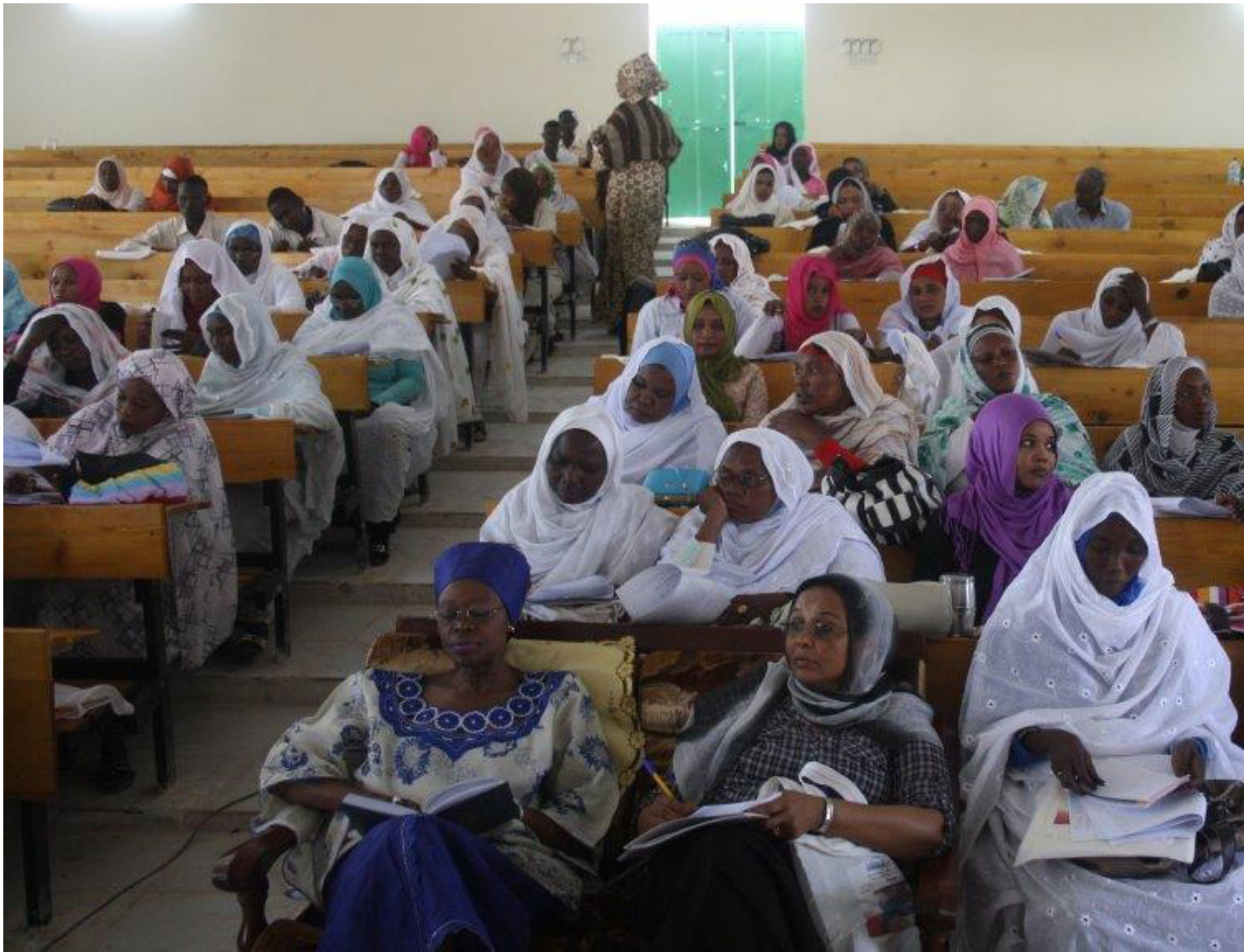
Women participants at the Darfur “Peak” Conference held in South Darfur.