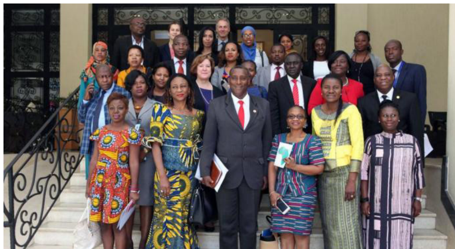
Participants at the launch representing UNAMID Human Rights Section; the African Centre for Democracy and Human Rights Studies; and OHCHR regional office for East Africa.

- Moussa Faki Mahamat, Chairperson of the African Union Commission