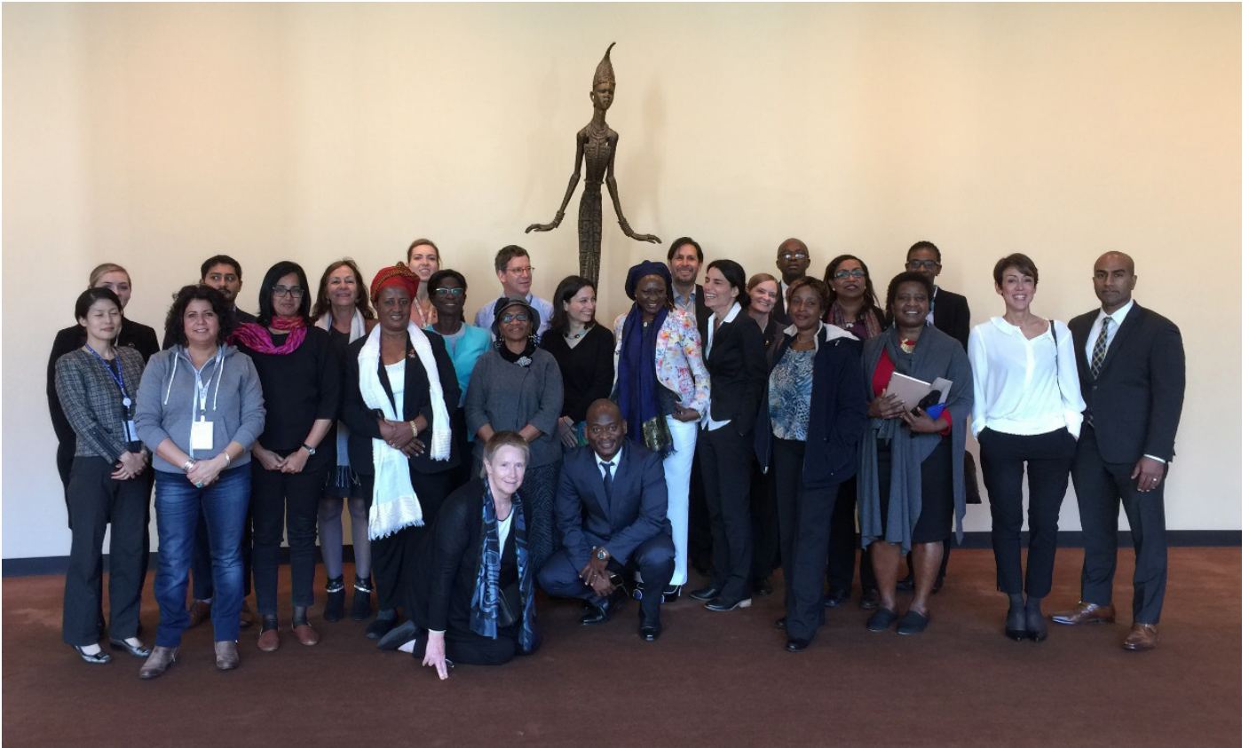
Women protection advisers at the biennial workshop on conflict related sexual violence in New York.

WOMEN'S RIGHTS are human rights. Women like men are entitled to the equal enjoyment of and protection of all human rights in the political, economic, cultural, civil social and all spheres of life. Women's rights should not be divided, suppressed or ignored by the law, but are to be protected and defended, more so in situations of conflict. Gender equality is one of the basic human rights whose achievement has enormous positive socio-economic ramifications to empower families and communities. Local customs, societal behavior and attitudes must cultivate and nurture rights allowing women and girls of all ages to enjoy the freedoms and entitlements due to them.