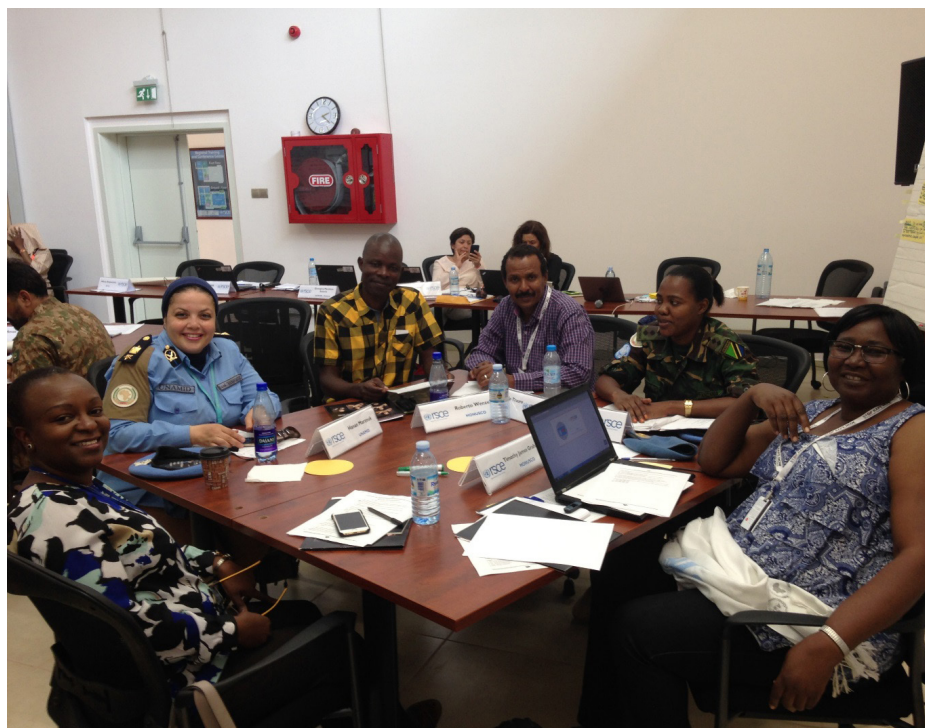
Participants representing UNAMID at the training workshop in Entebbe, Uganda