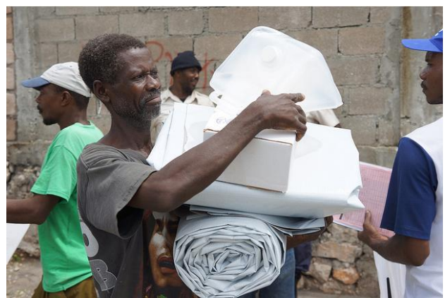
NFIs Distributions in camps