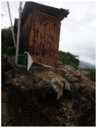
Damage in Bellevue extension camp – Port-au-Prince