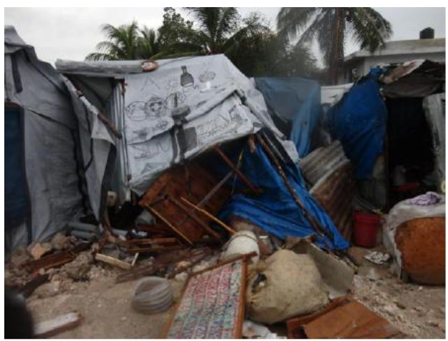
Damage in Jacques et Pitini camp - Pétion Ville